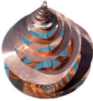
The 'Circle of Immortality' art piece

how I had created this art piece within the structure and layout of the film, in minute detail, stage by stage and consequently how I became aware that when you are attempting to express deep wisdom teachings through any form of media so that they may become a transmission to other people, what appears on the surface is the essential space within which an inner pattern or shape, containing the teachings, may express its truth.